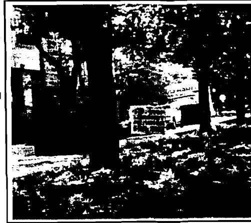
Signs on Sunset oppose a high-rise at 1717 Bissor

On Wednesday, a protest will be held at 1801 Bissonnet, next door to the proposed high rise site, from 4:45-6:15 p.m.